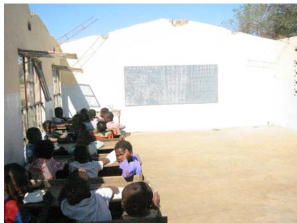
School building in Sabié—IMD Project August 2006

We appreciate your love, prayers and support.