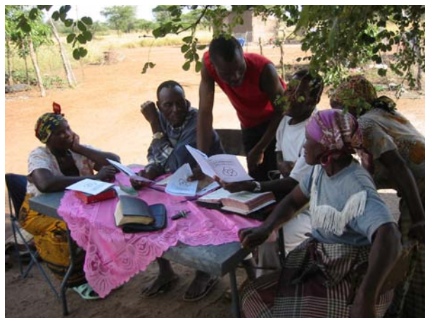
Leaders in Training

A handful of people responded to the gospel. I believe the Holy Spirit will keep what was seen alive in the hearts of the people. Please continue to pray for this area. The fallow ground is not fully broken up and the people watch us closely.