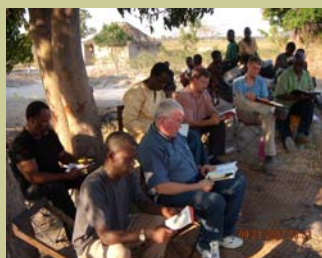
Teaching & Training